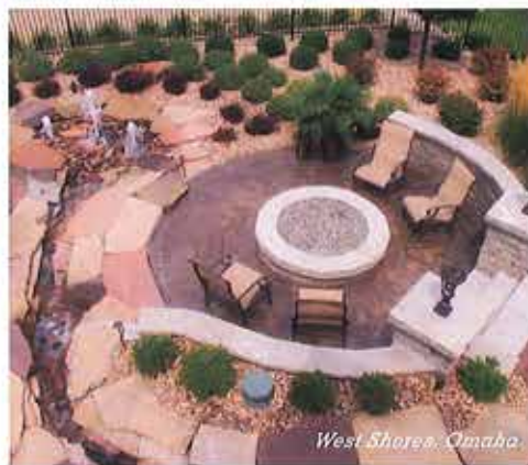
West Shores, Omaha