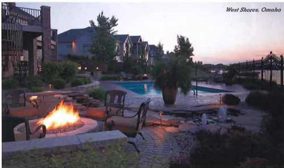
West Shores, Omaha