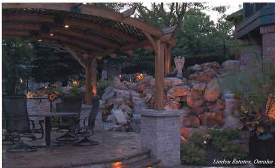
Linden Estates, Omaha